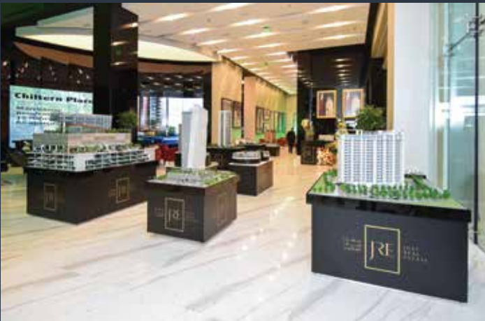
Just Real Estate (AMC)