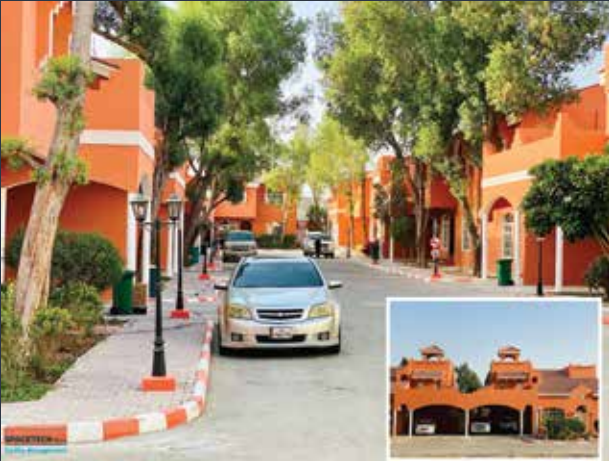
Ameera Garden Villa Compound Refurbishment