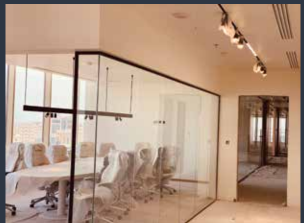
Nozul Building Fitout Works