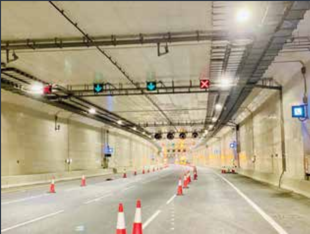
Rayyan tunnel Electrical work