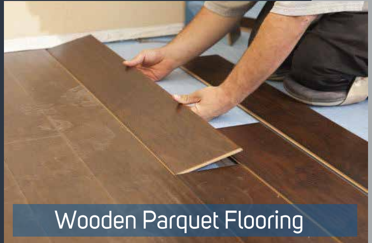
Wooden Parquet Flooring