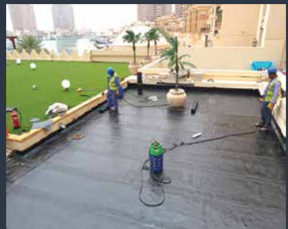
Rooftop Waterproofing In Pearl Qatar