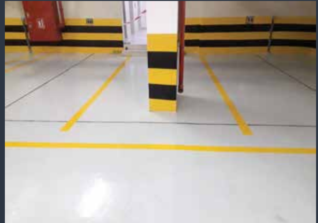
Car Parking Epoxy Flooring In AEB Building