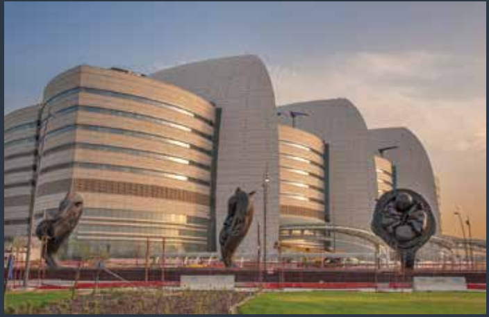
Sidra Medical (MEP)