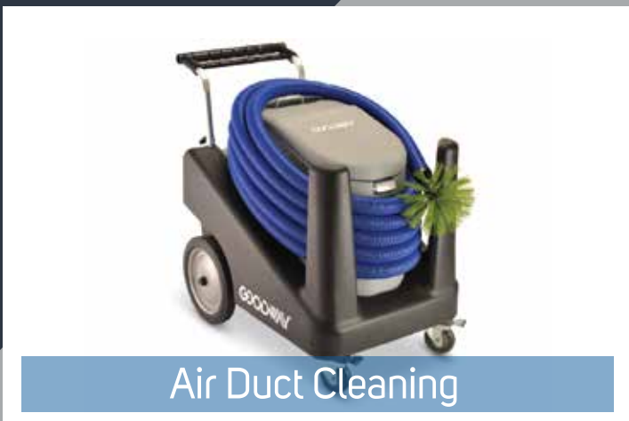
Air Duct Cleaning