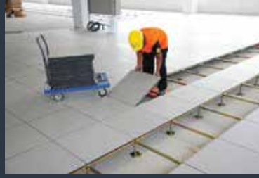
Raised Access Floor