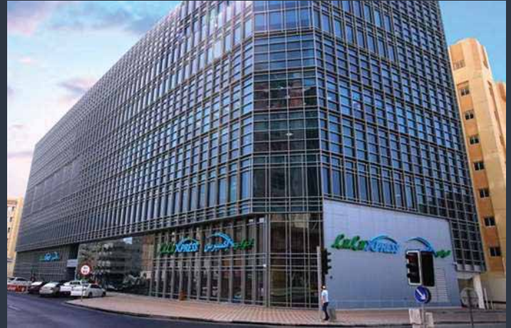
Lulu Express (AMC)