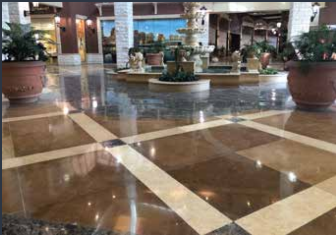
Marble Installation & Polishing In Pearl