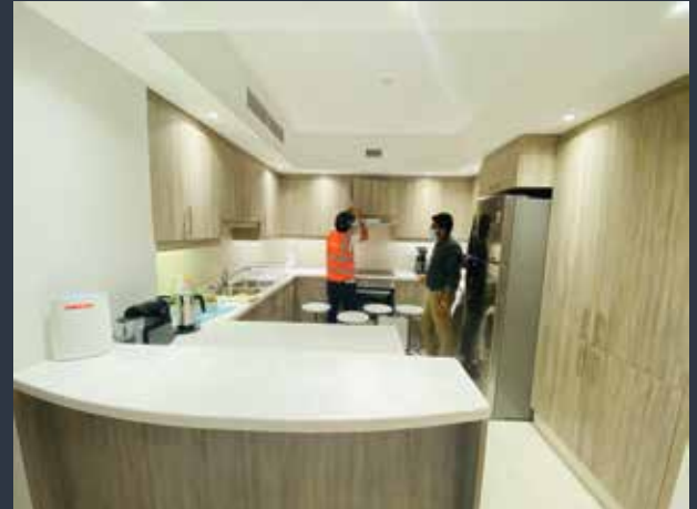
Apartment Refurbishment Pearl Qatar