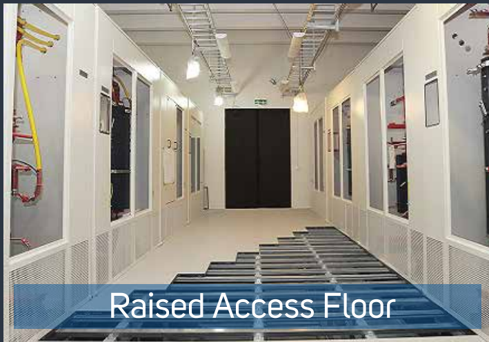
Raised Access Floor